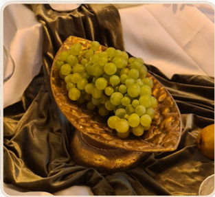
Gold trays for food