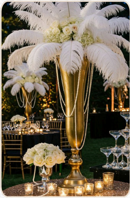
Custom-designed lavish floral arrangements