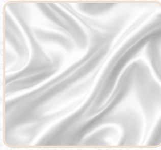
White table cloth