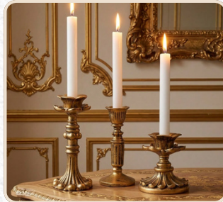
LED candles and brass candelholders