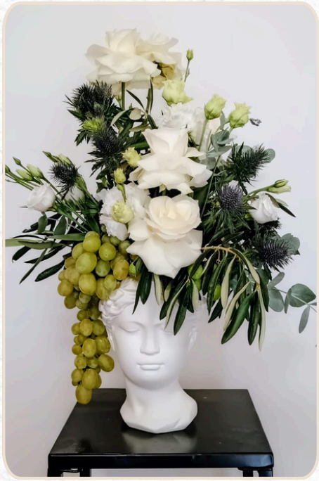
Custom-designed lavish floral arrangement