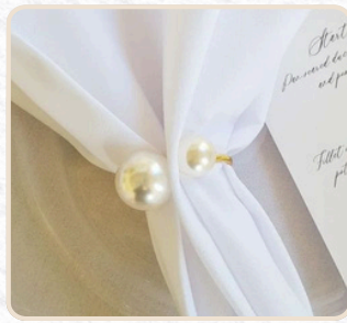
Elegant napkin rings