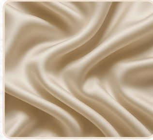
Champagne table cloth