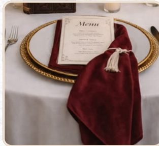
Dark red napkins