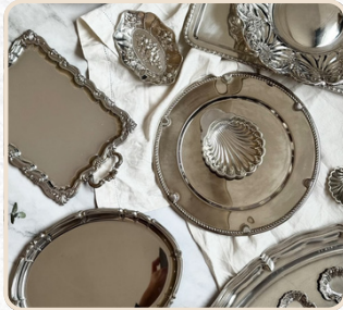
Trays for serving food