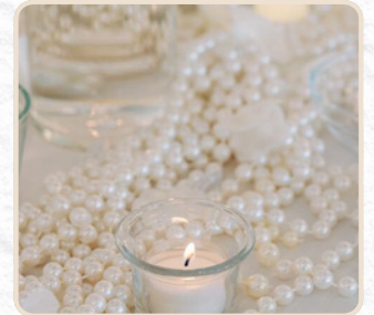
Pearls as a decor