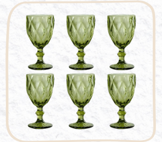
Green glasses for wine