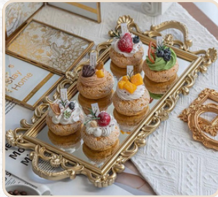
Trays for serving food