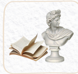
Decor - statues and old books