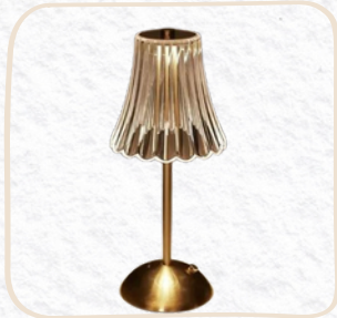
Gold wireless lamp