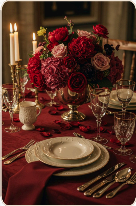
Custom-designed lavish floral arrangements