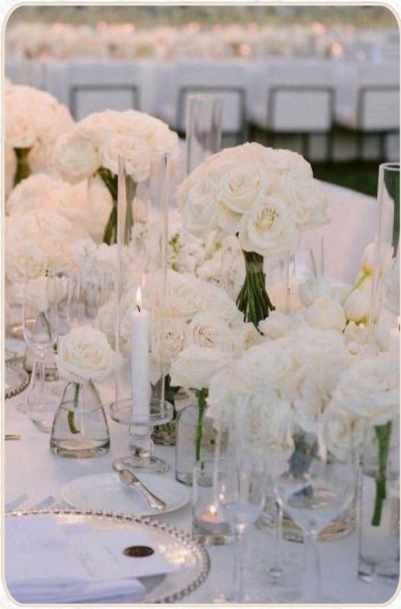
Custom-designed lavish floral arrangements