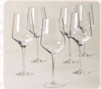
Glasses for water and wine