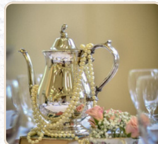
Decor details like mirrors, tea pots, old books and other details for decoration