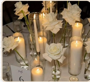
Led tapered candles and transparent candle holders