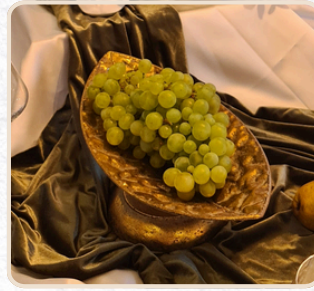
Antique old gold trays for food