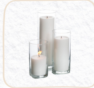
Candles in glass cylinders