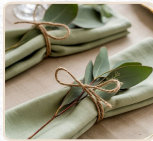
Green or white cotton napkins