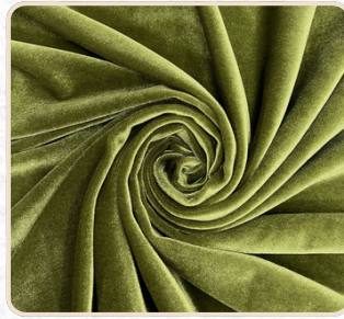
Olive green velur fabric