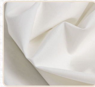
White or cream table cloth