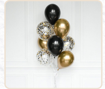
Gold and black balloon bouquet