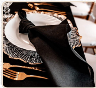
Black cotton napkins