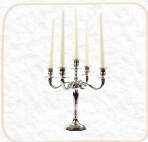
Silver metal candle holders with 5 LED tapered candles