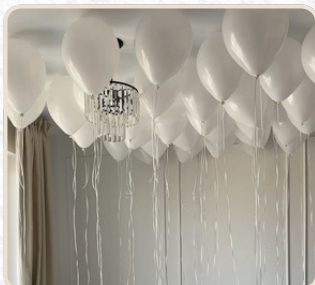
White helium ballons