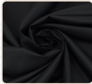
Black table cloth