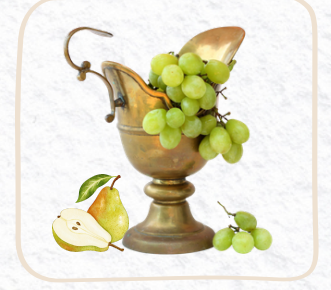
Fresh grapes and pears