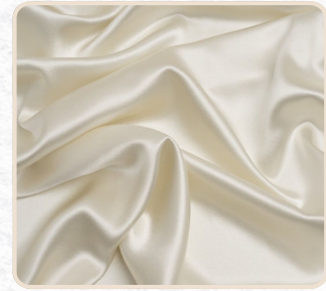
Satin white or cream fabric