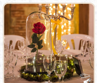
Beauty and the beast rose